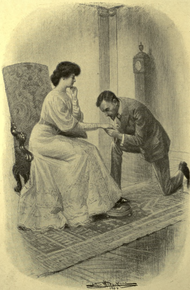
THE HOMAGE WAS DULY PAID